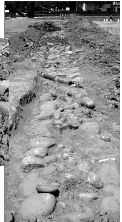
During the archeological dig of the mission foundation stones at the Olsen Project.