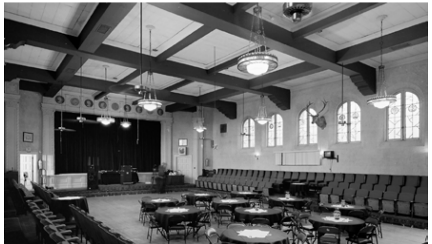
The Elks Lodge setting up for an event on October 25, 2003.

For 80 years, a soaring performance space with stained glass windows and a grand sweeping staircase has remained hidden three stories above Main Street. The third floor of the Elks Lodge is magnificent and, now that the Elks have relocated, the developer is considering his options for the re-use of the space. Like other historic building owners with large spaces that could be used for cultural programming, he wants to make it a public venue. But the economics don't work. It's costly to renovate and retrofit such buildings and most arts groups struggle to stay afloat. Build-